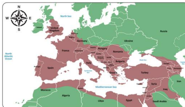
Roman Empire, AD 117–200

The Roman army conquered countries all around the Mediterranean Sea and so the Roman Empire grew to include many neighbouring lands. It was at its largest between AD 117 and AD 200.