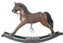
wooden rocking horse