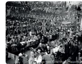
Street party to celebrate the coronation.