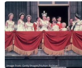
Queen Elizabeth II on her coronation.

In 1953, Queen Elizabeth II was crowned at Westminster Abbey, London. Many people celebrated the coronation by holding street parties