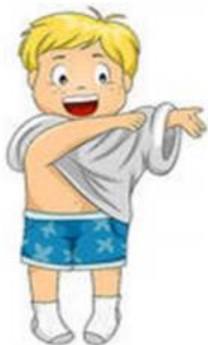
Dress and undress him/herself.

When your child starts school it would be helpful if he/ she could do some of these things: