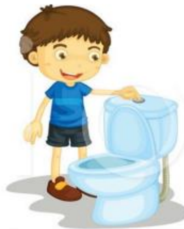
Use the toilet properly and flush it.