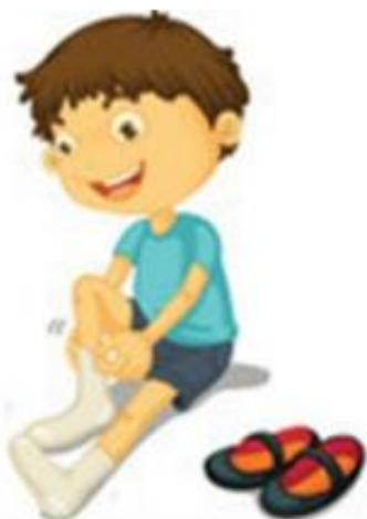
Change his/her own shoes and socks.