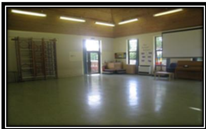
The School Hall