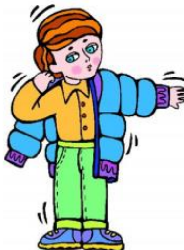
Put on and fasten his/ her coat.